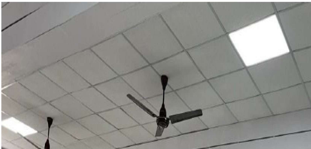
Uses of Led Light