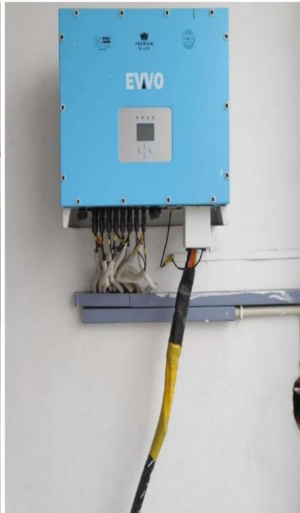
Solar Inverter panel