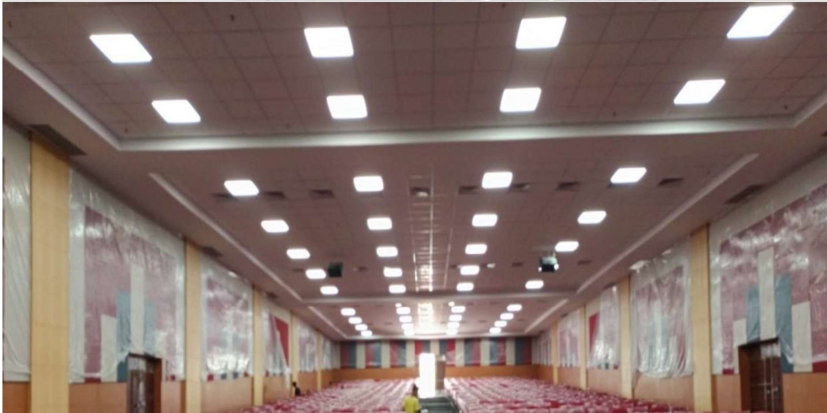
Uses of Led Light