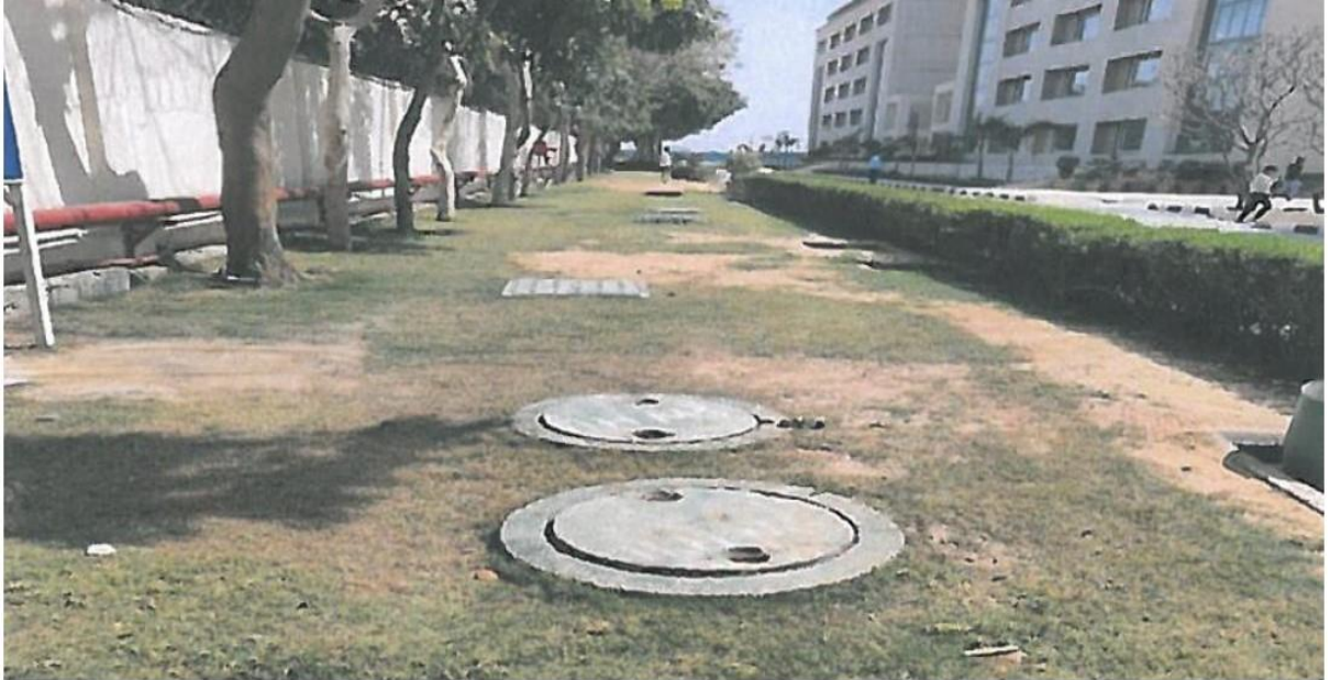
Recharge pits & Tanks at J. S. University

Rainwater Harvesting is the most economical and smart way to tap water resource. It keeps the campus free from water scarcity. During Rainy season water is channelized in one direction by using small channels and used to irrigate the university Campus, Lawns and garden.