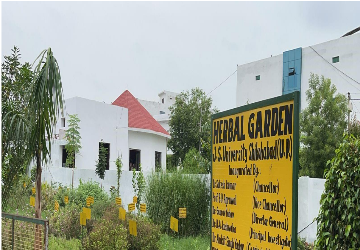
Herbal Garden at the University