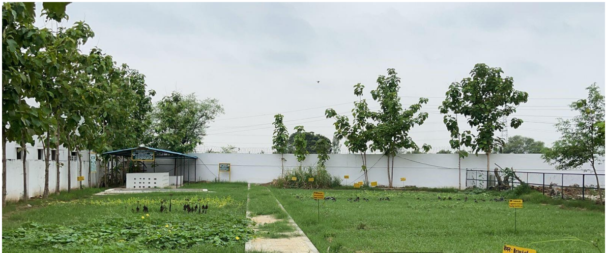
Landscaping with trees