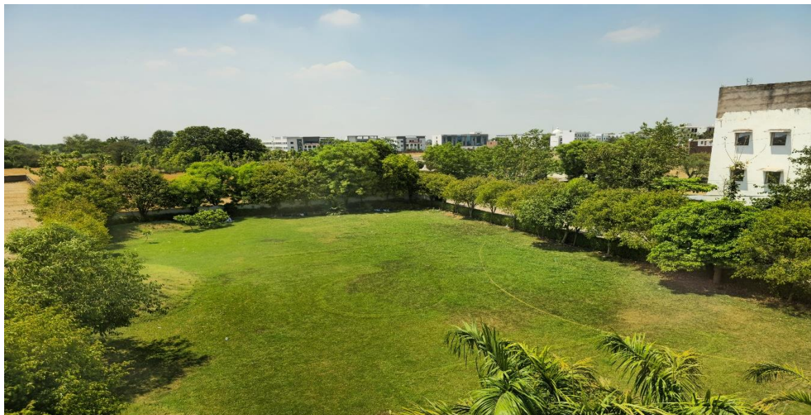
Landscaping with trees