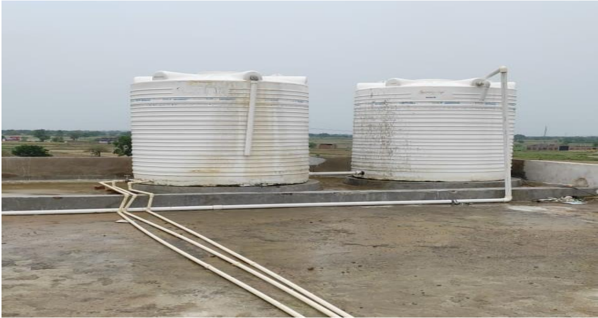
Water Storage system at J S University