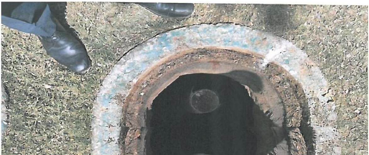
Borewell Recharge at J. S. University