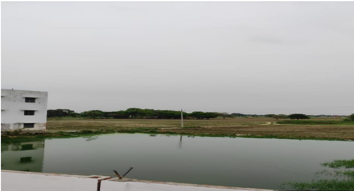
Pond for storage of Waste/Harvested Water