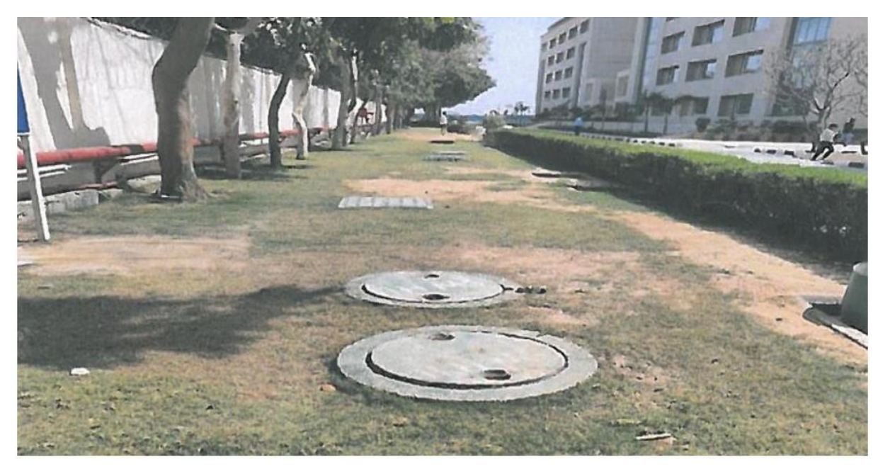
Recharge pits & Tanks at J. S. University

Rainwater Harvesting is the most economical and smart way to tap water resource. It keeps the campus free from water scarcity. During Rainy season water is channelized in one direction by using small channels and used to irrigate the university Campus, Lawns and garden.