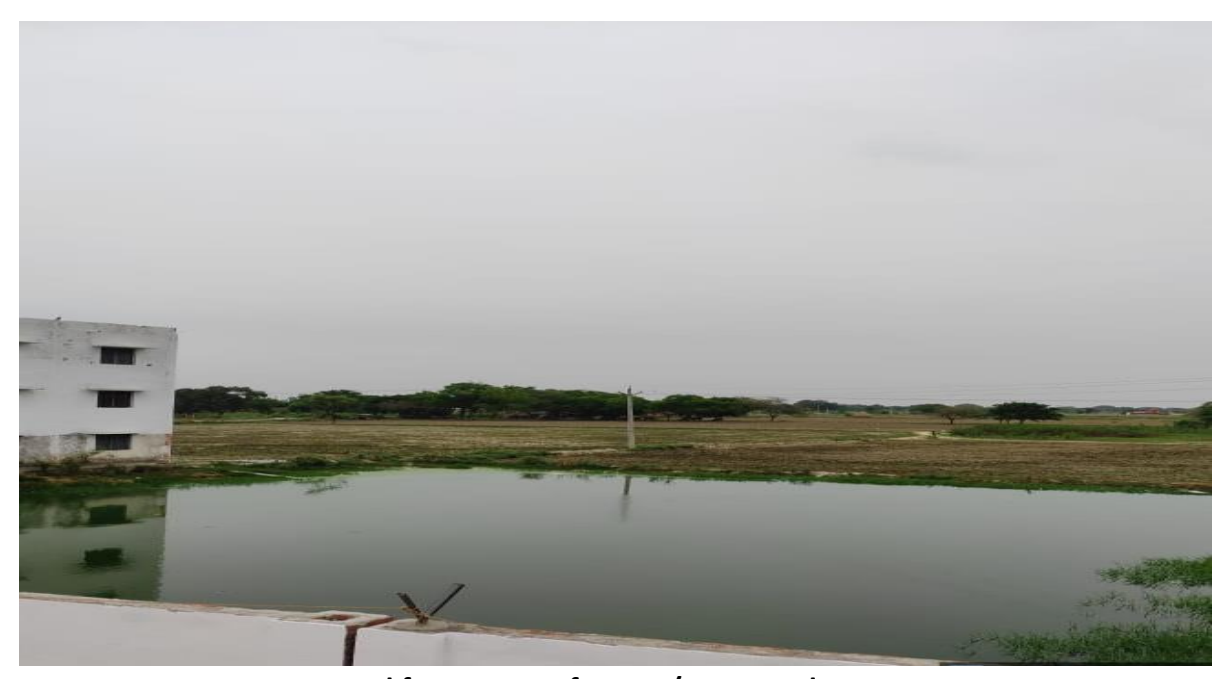
Pond for storage of Waste/Harvested Water