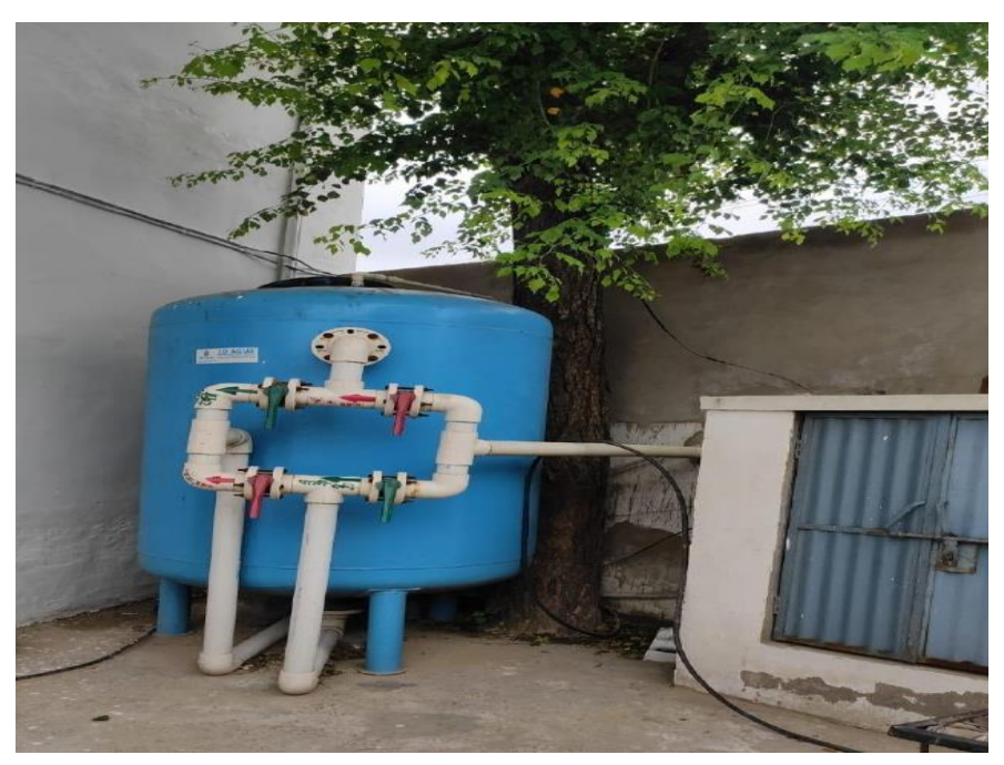
Water Treatment Plant