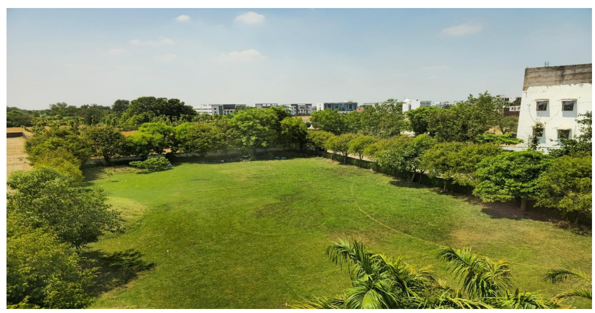
Landscaping with trees