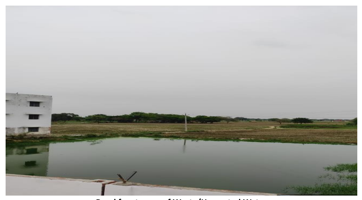
Pond for storage of Waste/Harvested Water