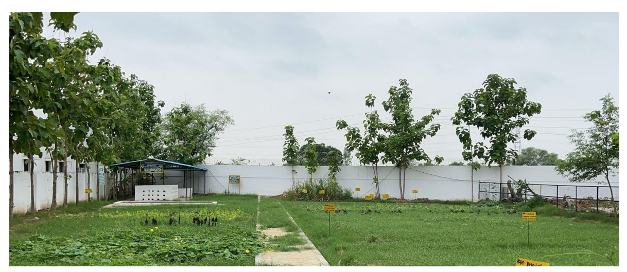
Landscaping with trees