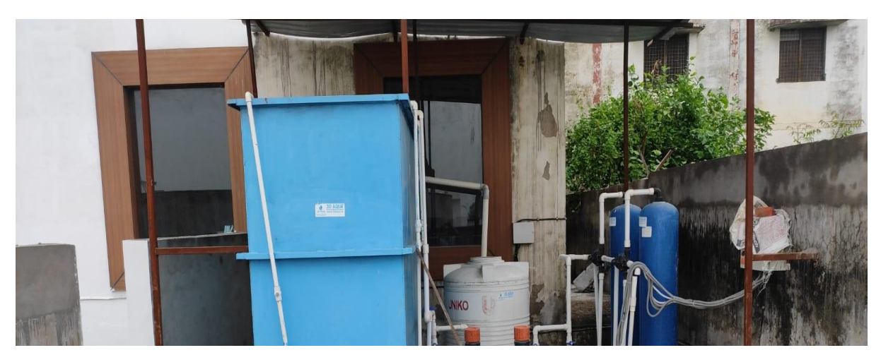
Sewage Treatment Plant