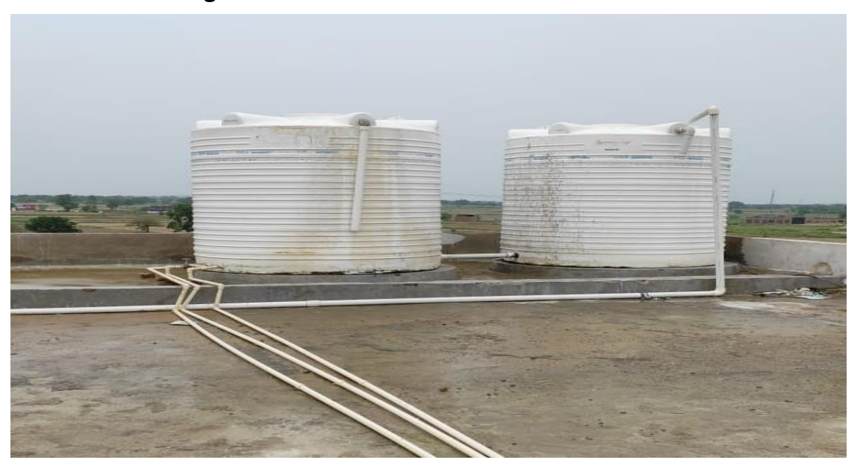
Water Storage system at J S University